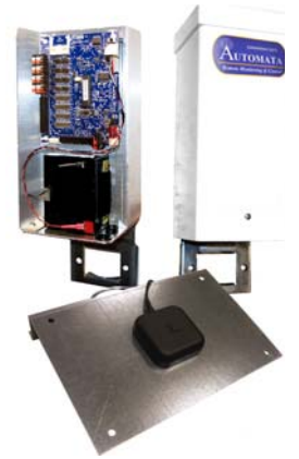
MINI-SAT™ Field Station

This MINI-SAT™ Soil Moisture System allows the user to remotely monitor soil moisture at four different locations and/or depths using Automata's AQUA-TEL-TDR soil moisture sensors. The data can be viewed on Automata's custom Webserver and includes graphing, arlamrs, etc. This system can also be combined with other Automata sites for a complete data acquisition and control system.